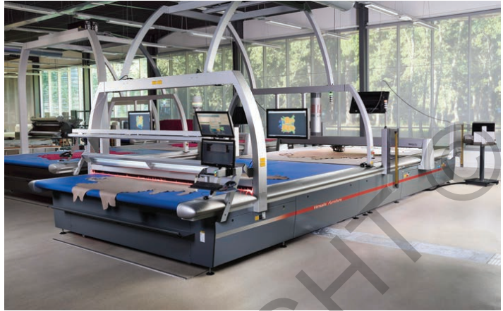
By using Lectra's Versalis automated leather cutting solution, Duvivier Canapés has been able to make significant improvements in productivity and cutting quality.

For Duvivier Canapés, the introduction of Versalis has brought three main advantages. The first is significant time savings due to the presence of a continuous cutting line. The technology is capable of digitising, nesting and cutting hides without the need for additional input. It has also allowed the brand to